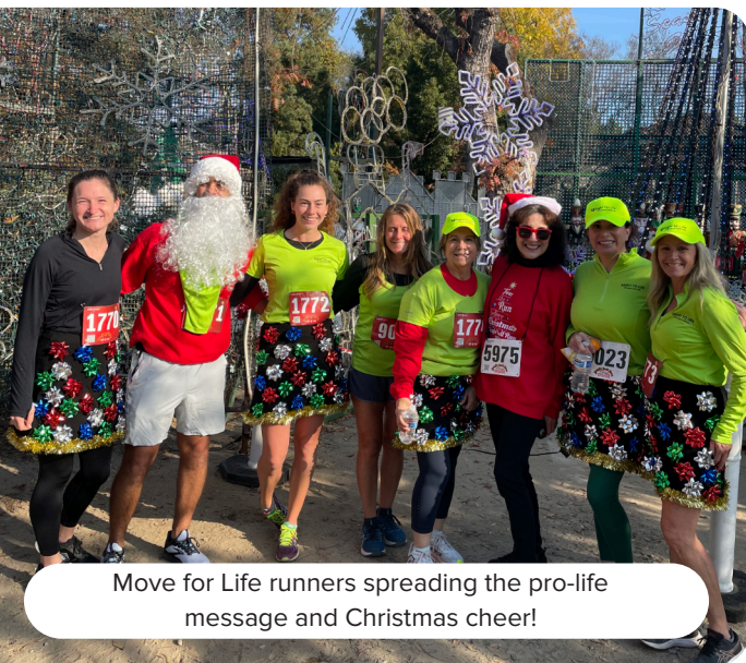
Move for Life runners spreading the pro-life message and Christmas cheer!

We rounded the year out with fifteen moms saying yes to life after a conversation held either out on the sidewalk or inside our newly redecorated outreach building. With the help of approximately 30 consistent prayer warriors, we have done wonderful things. One of our moms just delivered twins this past December. Meanwhile, we are preparing to host four additional baby showers for moms who are due in the next couple of months. We are looking forward to having a chance to see these moms deliver their babies and enjoy the love and hope provided by all of you.