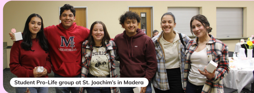
Student Pro-Life group at St. Joachim's in Madera